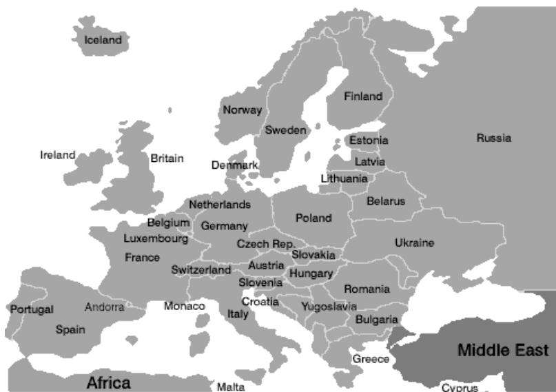
Map of Europe in 2011 CE

3. What are three differences between the map of Europe in 1648 and the map of Europe in 2011?